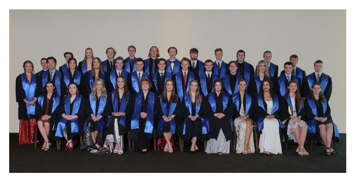
Year 12 Graduating Class of 2018

We were very proud of all Year 12 students for their motivation, hard work and leadership provided within the school. The College also acknowledges our teaching staff who professionally guided and supported our students.