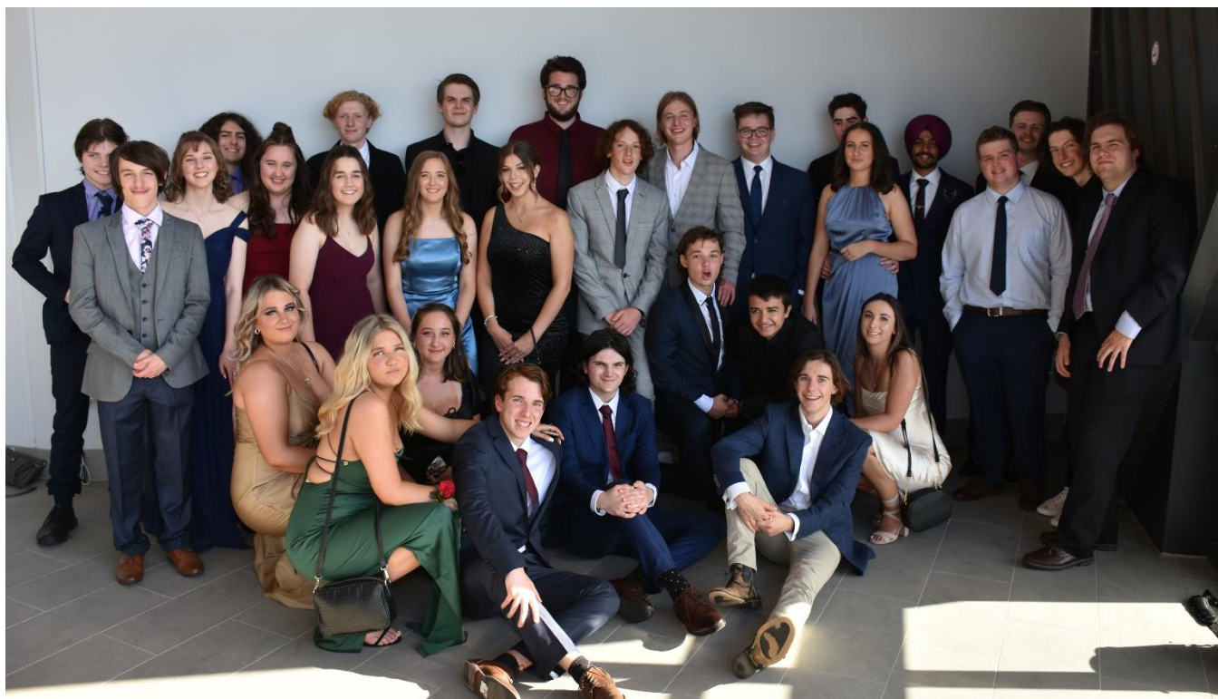
Year 12 Graduating Class of 2020

During 2020, 14 Senior Secondary students completed a Vocational Education Training course in the following areas: