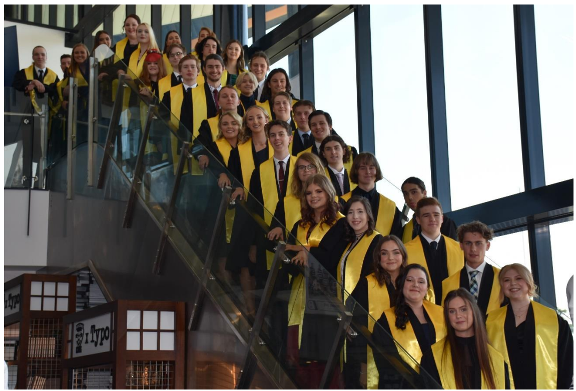
Year 12 Graduating Class of 2019

We were very proud of all Year 12 students for their motivation, hard work and leadership provided within the school. The College also acknowledges our teaching staff who professionally guided and supported our students.