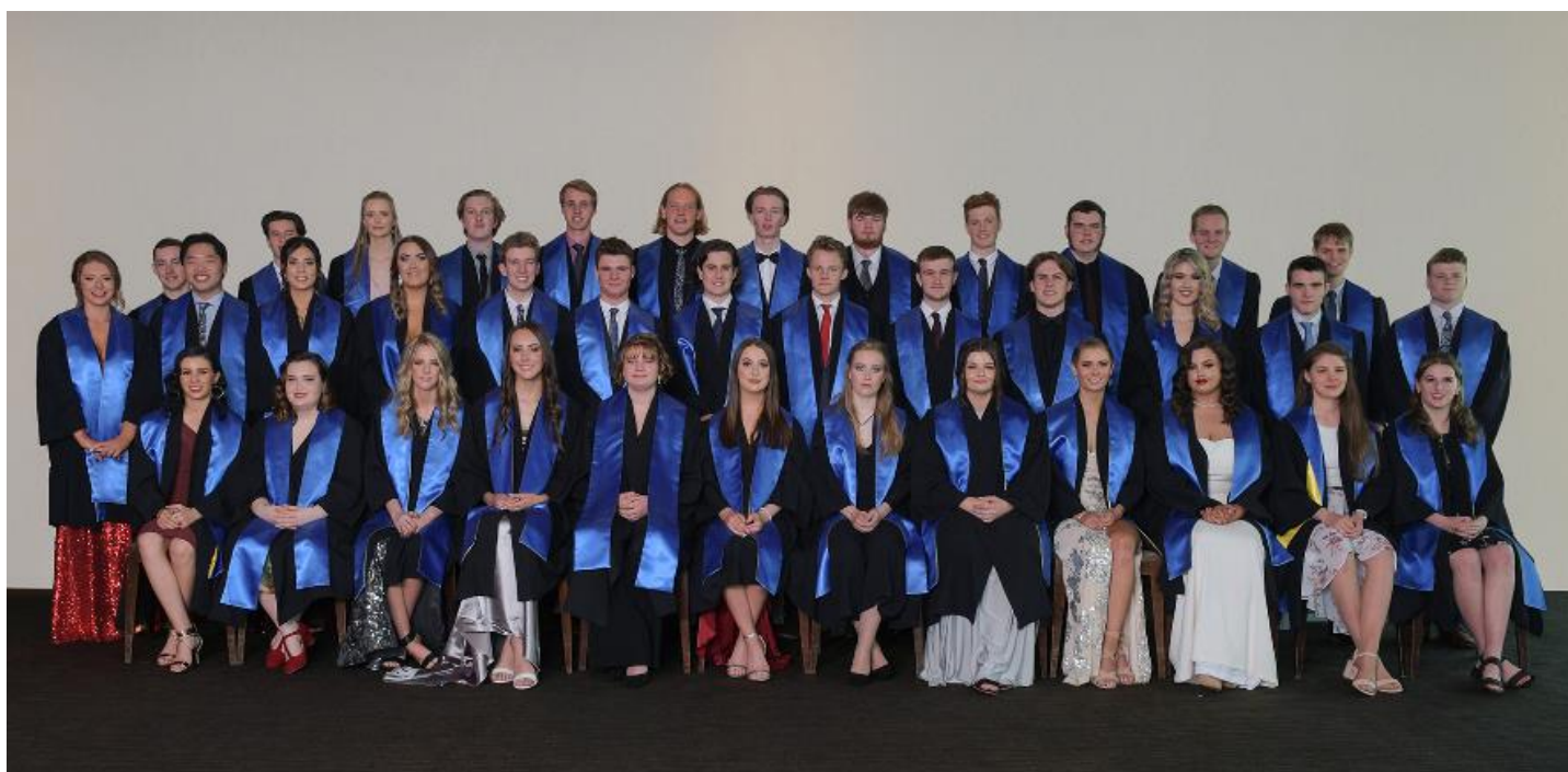
Year 12 Graduating Class of 2018

We were very proud of all Year 12 students for their motivation, hard work and leadership provided within the school. The College also acknowledges our teaching staff who professionally guided and supported our students.